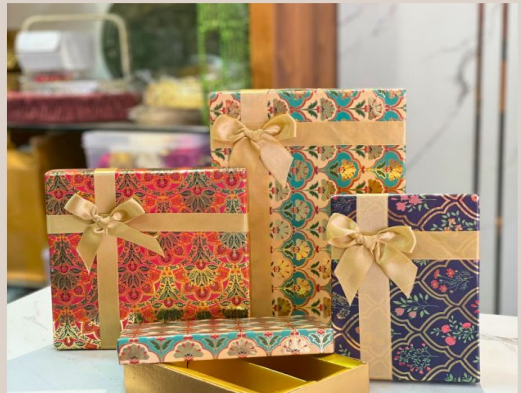
MITHAI HARDBOARD BOX

CODE - AP-14 SIZE - 250GRM 500 GRM 750 GRM