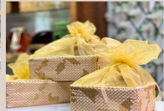
GLOBE POTLI HAMPER