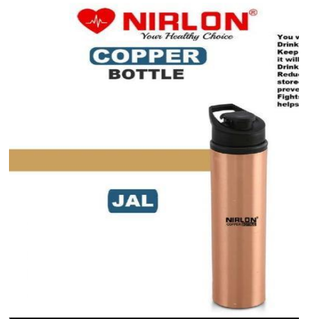
Copper bottle + Company branding