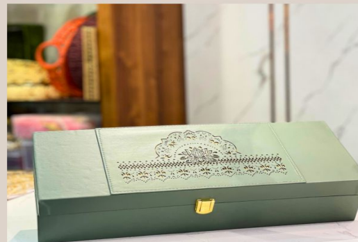
4 JAR LEATHER DRYFRUIT BOX